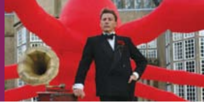
Artizani - Desert Island Discs