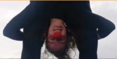
Megrez7: SURGE Labs see www.conflux.co.uk