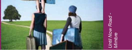
Until Now Road - Mimbire