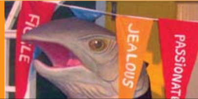
Salmon of Knowledge created by Cath Whippley