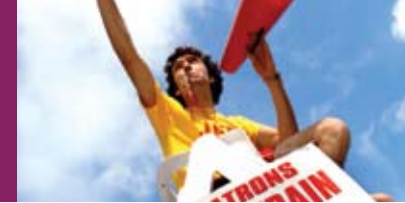
Fairly Famous Family - Lifeguards - Fools Paradise